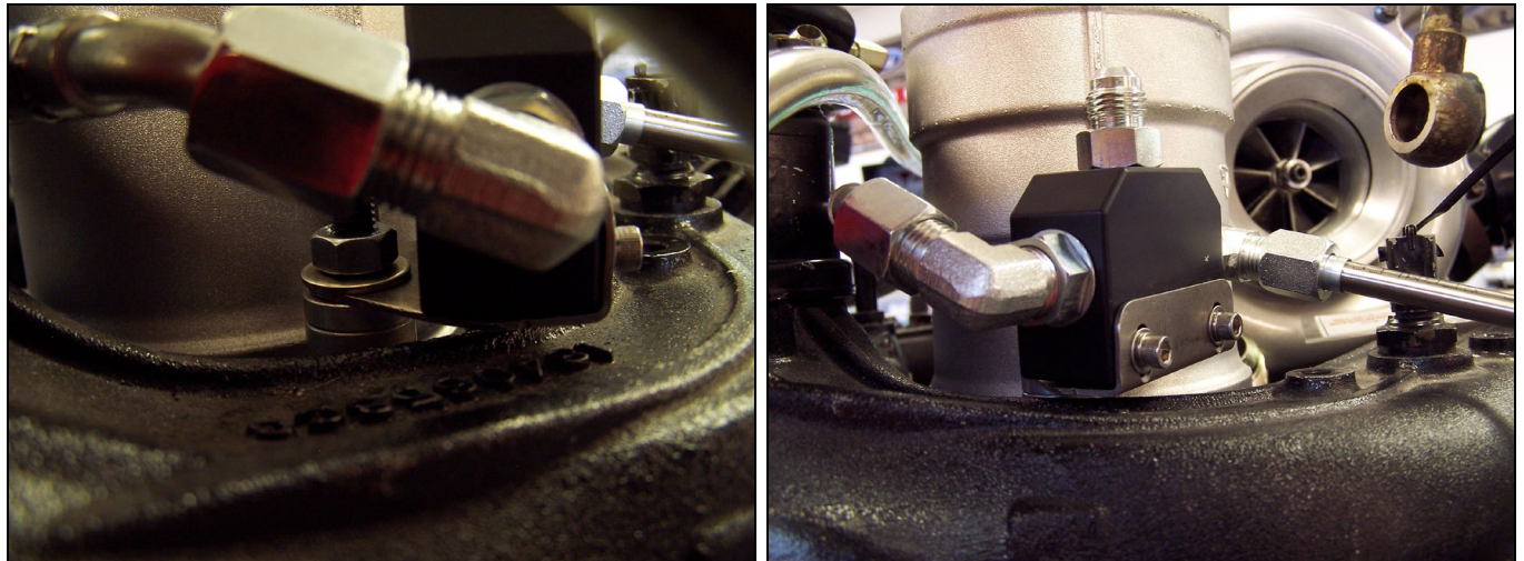
Spacers, Bracket, Top Washer and Nut Installed