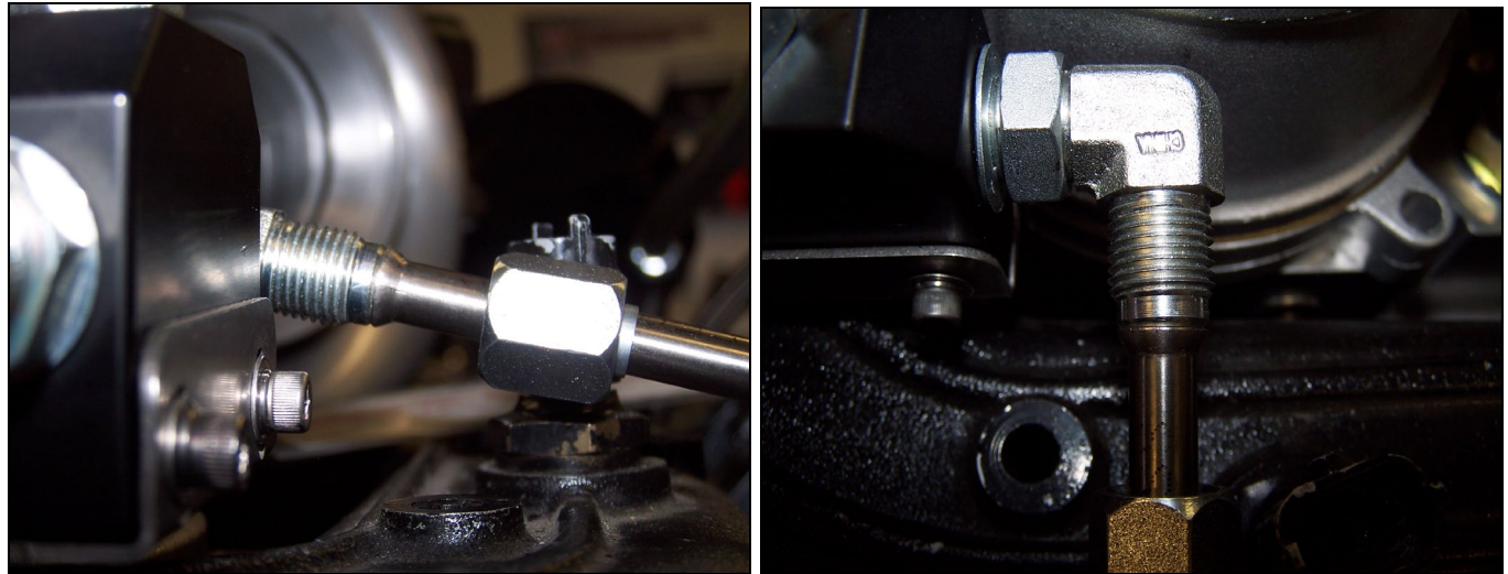
Side View – Tube and Fitting Aligned

See the images below for further clarification.